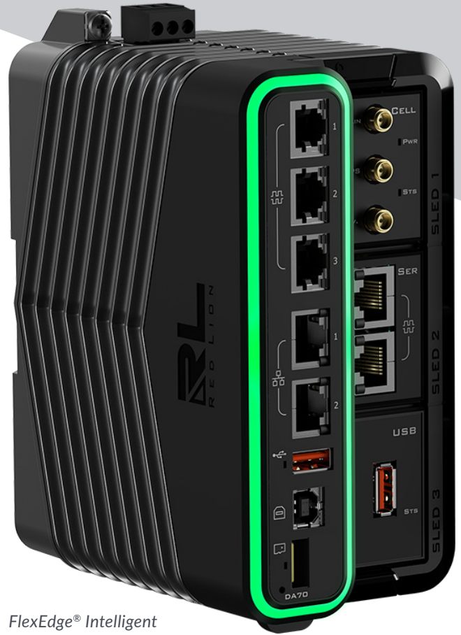
FlexEdge® Intelligent Edge Automation Platform

Increasing network and application security by implementing a DiD strategy can help align the IT and OT teams and create a more robust application. One way to get started is to build zones and conduits using VLANs, routers and monitored access control. In terms of the hardware, you only need layer 2 Ethernet switches to create the VLANs. Then, using routers and firewalls, you can build a path in and out of these smaller zones.